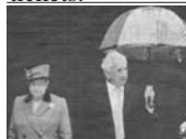
The Queen and Michael Winner in the rain.