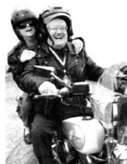
The "Harley Hogs" Mayor and Mayoress being dignified