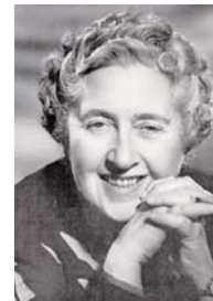
Playwright Agatha Christie

Please note new phone booking number: 01202 417484