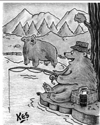
"Okay, you stick to the old method, Dave, but believe me, this is the future."

Our greatest hope is that The Studio Theatre will attract as new members people of an age group who have not been easy to reach in recent years. They in turn will 'fuel' not only the Studio itself, but hopefully our major productions for years to come.