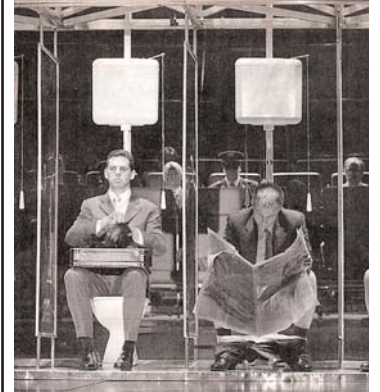
"Another opening of another show!"