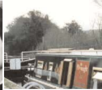
Canal-lovers, dog-walkers, cyclists and keen runners might occasionally spot David's narrowboat "The Playwright"