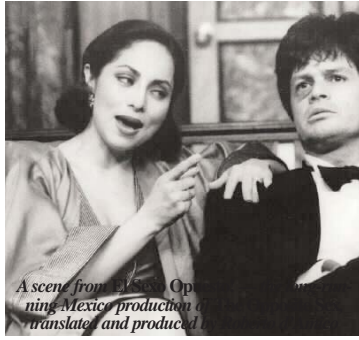
Ascend from the Opening Mexico production translated and produced

The Opposite Sex , one of the earliest comedies, received its professional premiere in South Africa, then went on to break box office