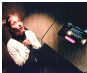
A theatre student does a Bard karaoke

Exhibition tickets range from £7.50 to £23 for a family ticket.