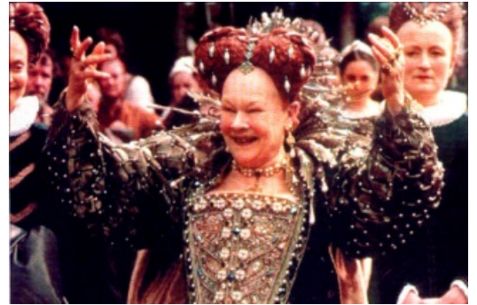
The Great Dame, seen above in her Oscar-winning role as Queen Elizabeth in Shakespeare in Love

Technically, the attraction features two booths with interactive screens and microphones. Tourists will have a choice of short scenes in which to participate. Among them are Hamlet's encounter with the gravedigger and poor Yorick's skull, Julius Caesar's meeting with the baleful soothsayer who reenacts the