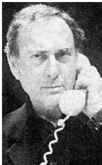
Pinter for the Defence

SCOTLAND YARD has agreed to pay eleven Kurds a total of £55,000 after armed police arrested them as they rehearsed a Harold Pinter play about persecution and injustice.